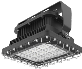
Ceiling (shown with wire guard) (#WG01 ordered separately)