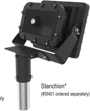
Stanchion* (#SN01 ordered separately)

*Conduit and stanchion shown for illustration purposes only