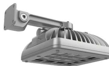
Shown with X1 (Wall Mount) and G (Lens Guard) options

*For reference only. .ies files available upon request.